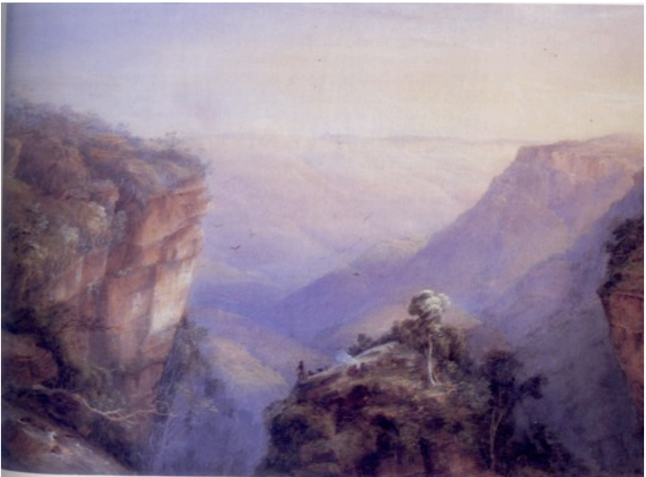
Conrad Martens, ca, 1840